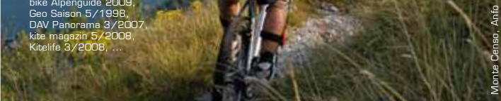
Monte Canso, Anfo