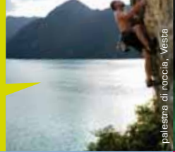
palestra di roccia, Vestia

detailed information on alpine hiking, climbing parks, rock climbing and "via ferrata"